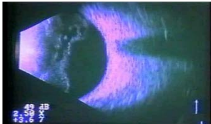
Detached Vitreous Gel